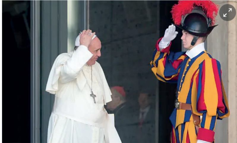
▲ A Swiss Guard salutes Pope Francis at the Vatican.

Book includes recipes chosen by Vatican officials and some of the pontiff's favourite Argentinian dishes